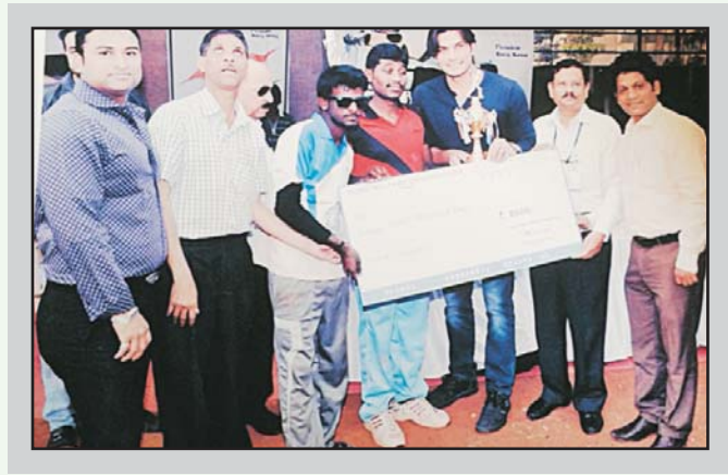
IFCR Donation to Rotary District Welfare Fund