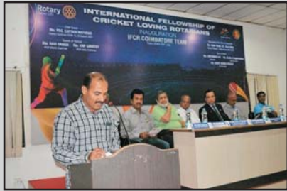
IFCR CBE Convener Welcoming the Gathering