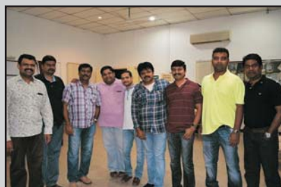
The Newly Inducted IFCR COIMBATORE TEAM Members enjoying the evening