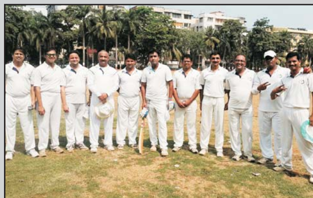
“A” group Runners R. C. Dombivli Midtown-City