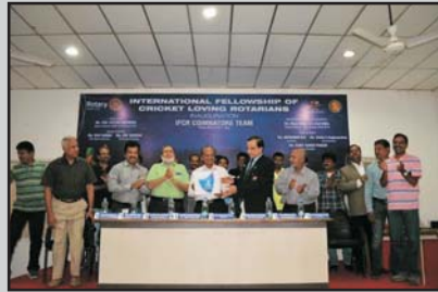
IFCR COIMBATORE TEAM LOGO Being Launched by the Officials on the Dias