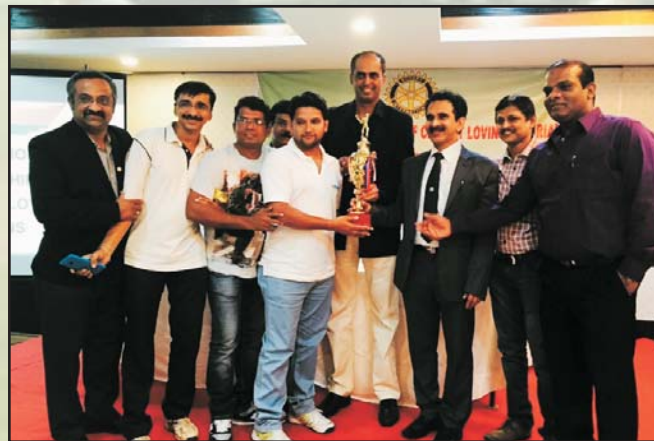
R. C. Midtown -City Runnersup Trophy in "A" Group