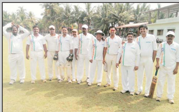
R. C. Dombivli West