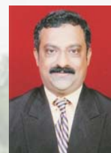
IFCR 3140 Secretary