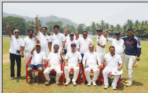
RC Thane Suburban