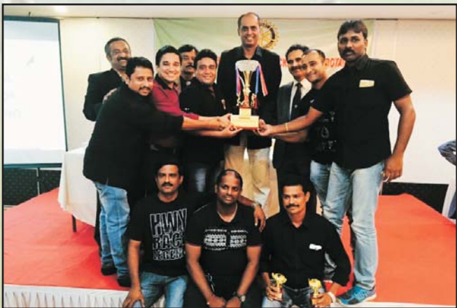
R. C. Dombivli West with Trophy in "B" & "C" Group