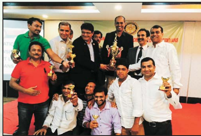
R. C. Borivli Winners of "A" Group