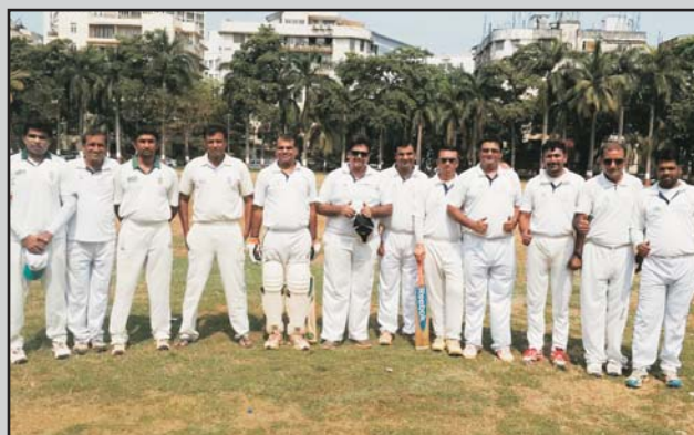
“A” group Winner R. C. Borivli