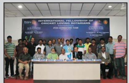
The Newly Inducted IFCR COIMBATORE TEAM