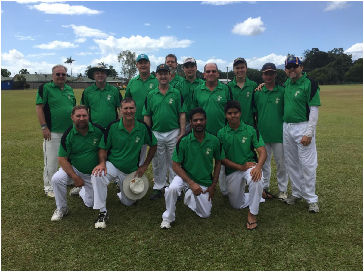
FNQ ROTARY OLD CROCKS – Great Barrier Reef Masters Games Cairns 2015

The September newsletter is a bit late and had nothing to do with cricket. I have been celebrating the NRL COWBOYS NRL premiership for two weeks now (the game result is the same after 17 replays!!!) but it is time to 'move on' and discuss happenings within IFCR Australia since June 2015.