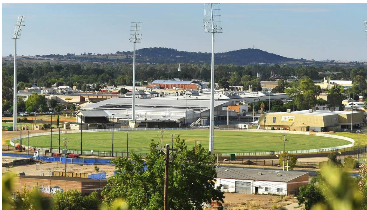
Robertson Oval – Wagga Wagga

Picturesque Robertson Oval will be the main venue for the matches during that week.