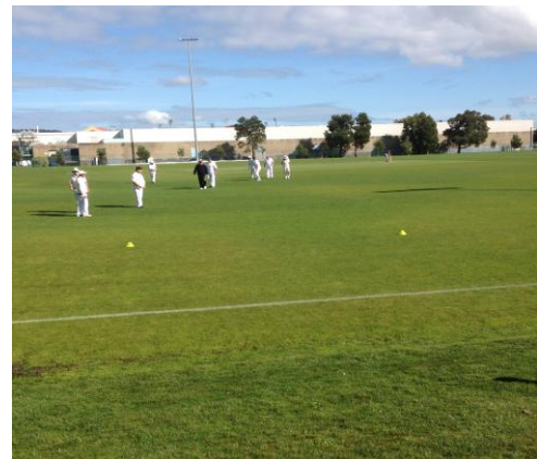
The game at Launceston.